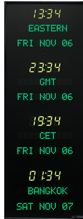
Model 3073C - 1.8" time, 1.2" zone labels, 1.2" date, 4 zones